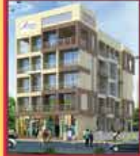
Sarang Ritvi Ulwe