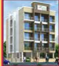
Sarang Aarvi Karanjade