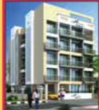
Sarang Aagam Ulwe