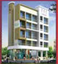
Sarang Srushti Ulwe