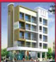
Sarang Srushti Ulwe