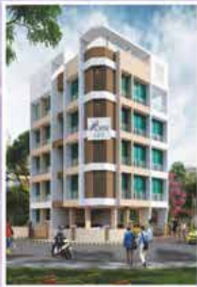
Sarang Lily Plot No. 50, Sector - R1 RERA No.: P52000017781