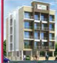
Sarang Aarvi Karanjade