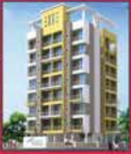
Sarang Arham Karanjade