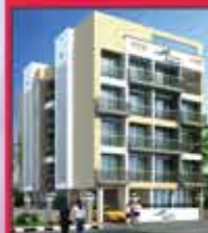
Sarang Aagam Ulwe