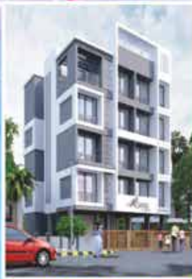
Sarang Daisy Plot No. 6, Sector - R5 RERA No.: P52000020676