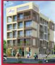
Sarang Ritvi Ulwe