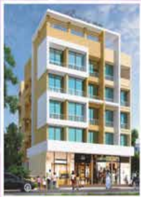
Sarang Iris Plot No. 139, Sector - R5 RERA No.: P52000022473