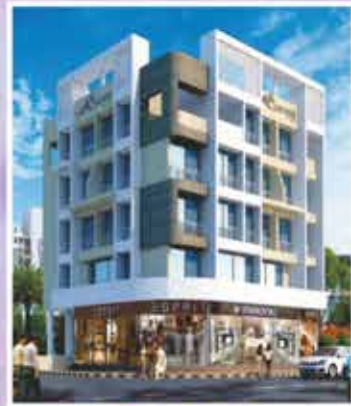
Sarang Tulip Plot No. 96, Sector - R1 RERA No.: P52000022531