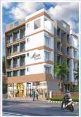
Sarang Orchid Plot No. 35, Sector - R1 RERA No.: P52000017462